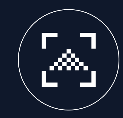
1920*1080 Screen resolution