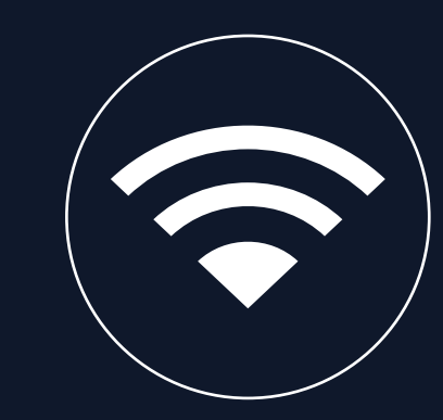
Dual-band WiFi Running 24/7 without